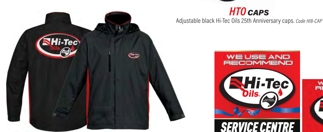
HI-TEC OILS UNISEX JACKET Weatherproof rain jacket. Embroidered logo on front and logo on rear. Code HI8-UNI JACKET